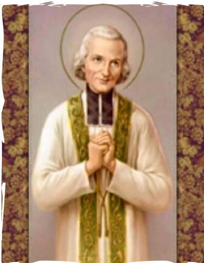
St John Vianney - the Cure of Ars

Jean Marie Vianney grew up in a shepherding family while the French Revolution overturned his country. At that time, the practice of the Catholic faith was banned in many places; priests and religious were hunted down, executed or exiled.